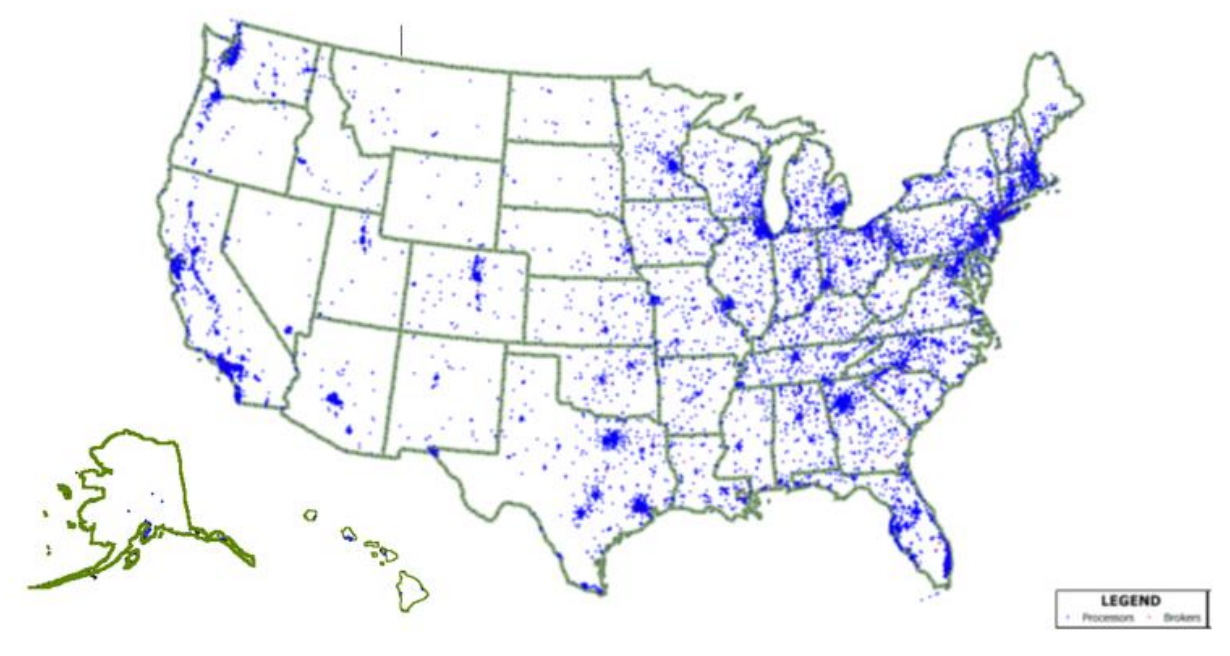
Figure 1. Map of Domestic Scrap Recycling Facilities

Scrap recycling companies range in size from small family-run operations than in many cases have been doing business for generations to very large multinational corporations. In the United States, a large proportion of scrap recycling companies are small and medium enterprises and scrap recycling facilities located in every state of the nation.