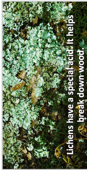
Lichens have a special acid. It helps break down wood.