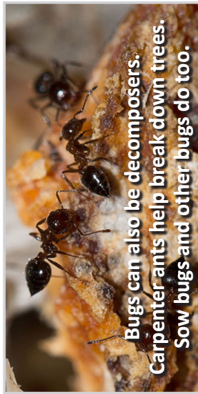
Bugs can also be decomposers. Carpenter ants help break down trees. Saw bugs and other bugs do too.