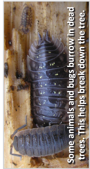
Some animals and bugs burrow in dead trees. This helps break down the tree.