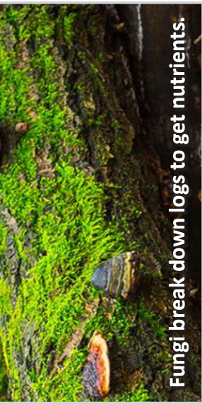
Fungi break down logs to get nutrients.